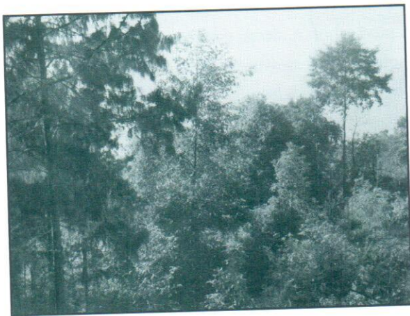
Trupti Parekh Mehta

Traditions of local community control were disrupted when national governments took over, and local communities lost incentives for stewardship. What was once a well-regulated common resource became a free-for-all open-access resource, nominally under government control.